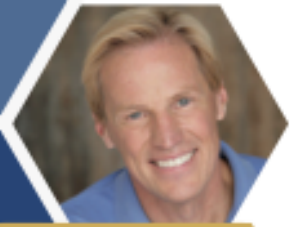
John Jacobson Elementary Headliner